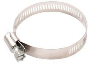
107.287: Hose clip Ø38/60 mm